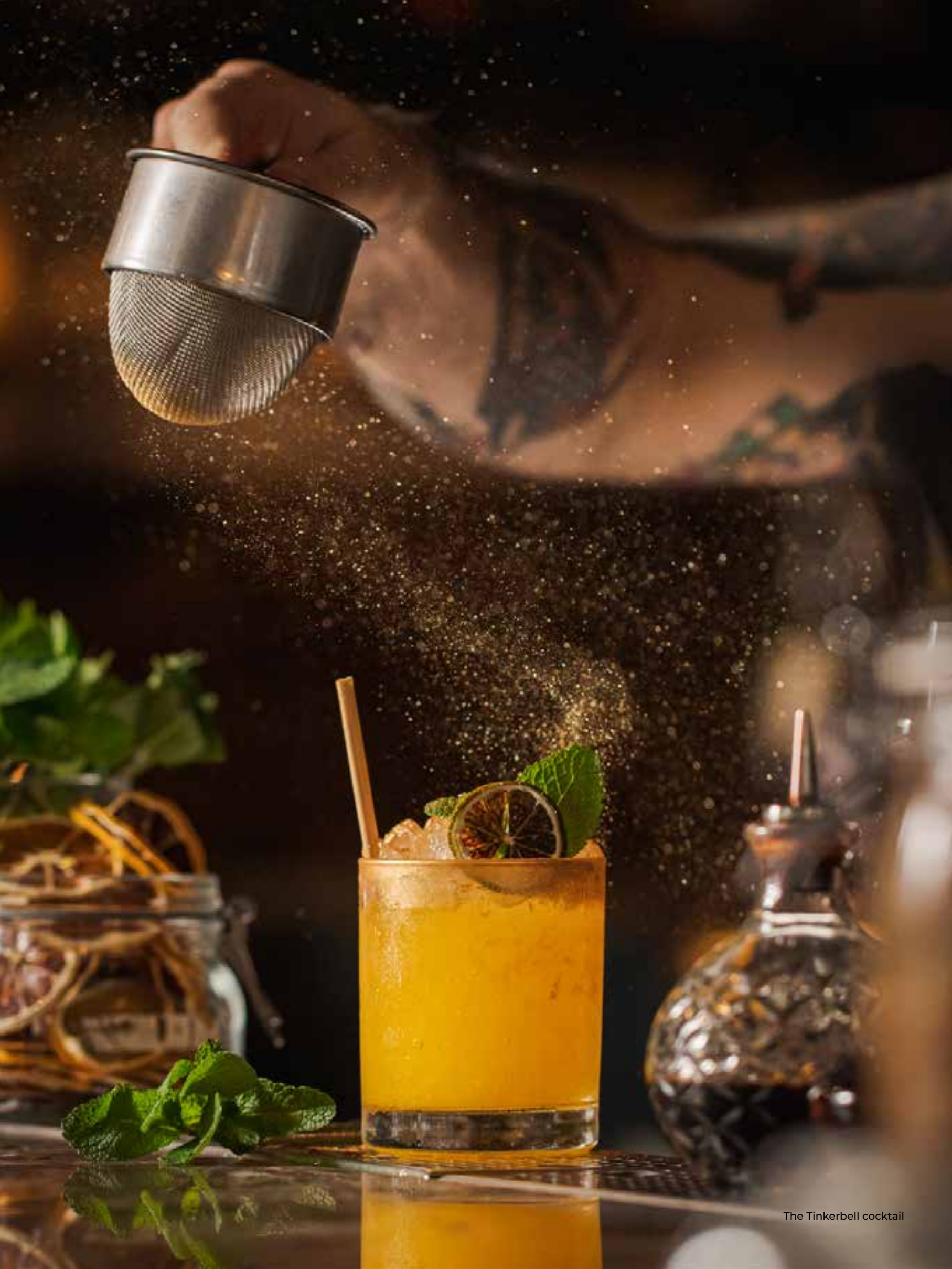
The Tinkerbell cocktail